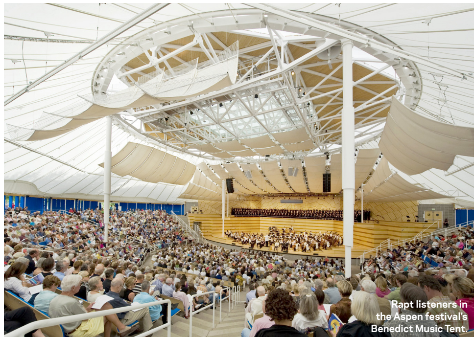
Rapt listeners in the Aspen festival's Benedict Music Tent.

EVERY JULY the Berkshires, the Rockies and pastoral settings between and beyond echo with the sounds of great artists lending their talents to nurture a new generation. The strong mentoring tradition shared among classical musicians thrives in Arcadian spots like Lenox, Massachusetts, where the Tanglewood Music Center, the Boston Symphony Orchestra's summer academy, is now in its seventieth season ( June 26–September 5; tanglewood.org ), and Aspen, Colorado, where the Aspen Music Festival and School celebrates its sixty-first ( July 1–August 22; aspenmusicfestival.com ). At these established venues and at many smaller ones, audiences can witness firsthand the transfer of musical knowledge by attending concerts, open rehearsals and master classes—an always